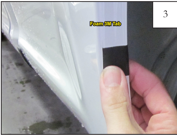
Wrap a Foam Tab (MT1-0034) around the wheel well sheet metal, centered over the mark made in Step 2.