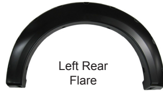
Left Rear Flare