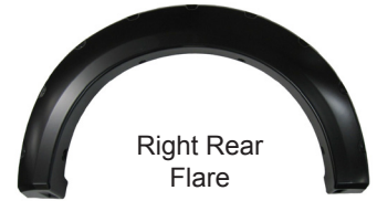
Right Rear Flare