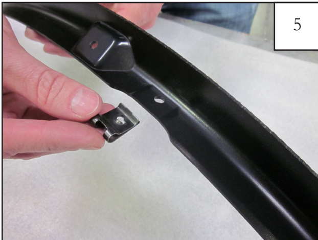
Verify presence of U-Clips on inner brackets.