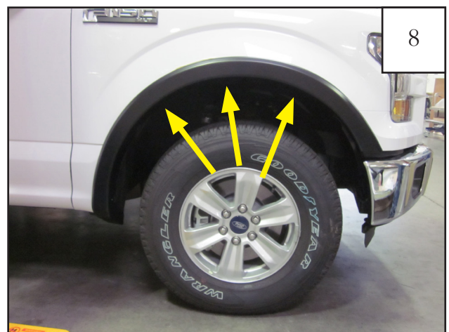
Position flare on fender, pressing inward on the flare, line up the flare mounting holes with the mounting clips on the inner piece. Install 3 Phillips Truss Screws (SW1-0058) through the flare and into the clips on the inner piece. Do not tighten. (3 locations)