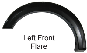
Left Front Flare