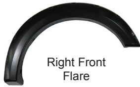
Right Front Flare