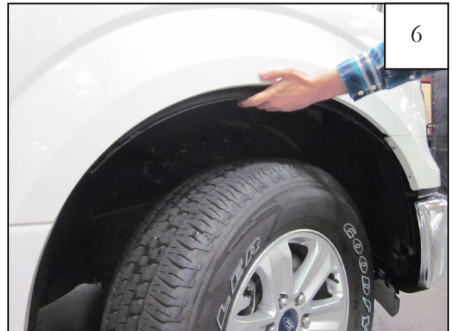
Line up the holes in the inner piece with the three uppermost factory holes. NOTE: Driver's side inner piece is marked with an "LR" and passenger's side inner piece is marked with an "RR".